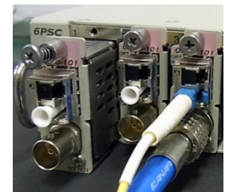
Figure.1 OE converter installation

Note) Be sure to keep the ferrule tip of the plug and the internal of LC connector clean as shown in Figure 2. If a fiber-optic connector becomes dirty, the lighting output loss may be increased.