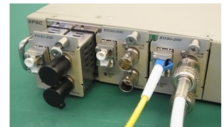
Figure.1 EO converter installation

Note) Be sure to keep the ferrule tip of the plug and the internal of LC connector clean as shown in Figure 2 . If a fiber-optic connector becomes dirty, the lighting output loss may be increased.